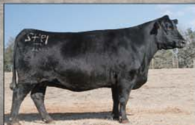
GAR 1407 New Design 1942

The $660,000 valued female who topped a recent Three Trees sale is the dam of a GAR Retail Product daughter who sells.