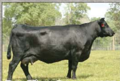
Bon View Gammer 233

Ritas, Blackcaps, Lady Jaye, Forever Lady, Blacklass, Gammers, Ericas, Ladys, and Primrose along with many more!