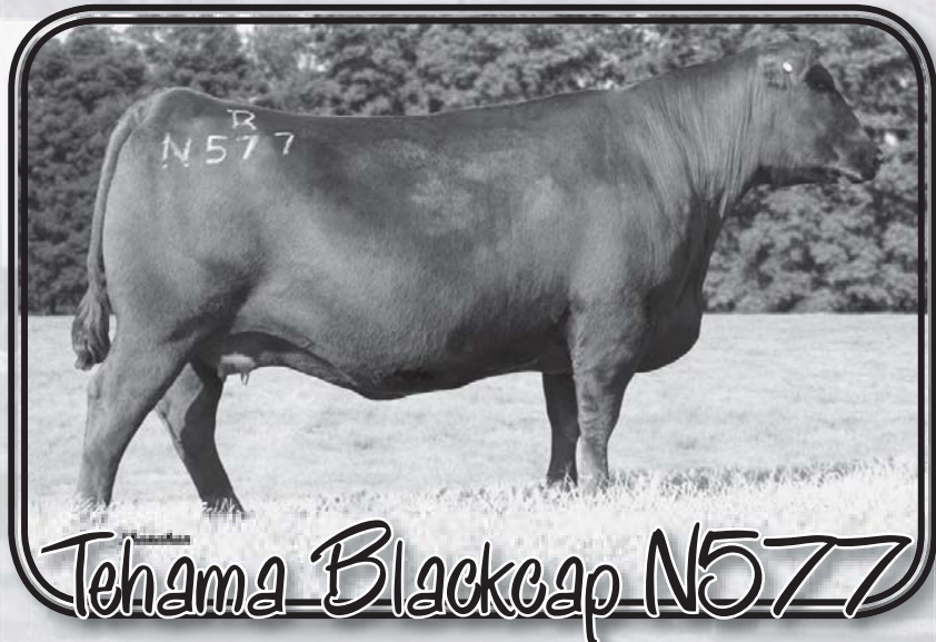
Tehama Blackcap N577

This outstanding daughter of Bon View New Design 878 goes back to a daughter of the $30,000 Tehama Blackcap G360. This powerful donor will offer a confirmed heifer calf pregnancy by DHD Traveler 6807 due this fall in this exciting event.