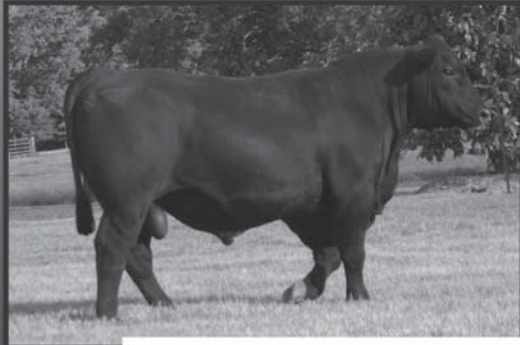
1752 - This "004" son sells.

Saturday - December 3, 2011 - 12:00 NOON at the farm