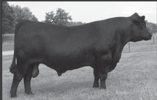
SAV Plaintiff 0459 - Females carrying the service of our junior herdsire SAV Plaintiff sell Dec. 3rd.