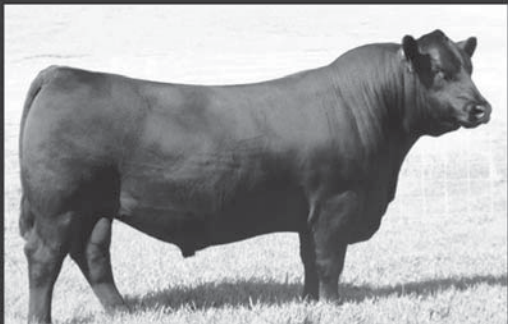
SAV Momentum 9274 - This high selling Net Worth son of the 2010 SAV sale calls Bramblett/Britt Angus home. His valuable service sells.