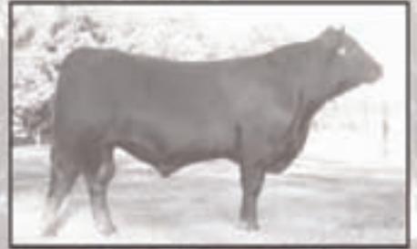
Partisover Net Worth 030 Reg: 16613266 Sire: S A V Net Worth