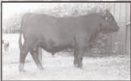
Partisover Final Answer 030 Reg: 16613262 Sire: S A V Final Answer 0035