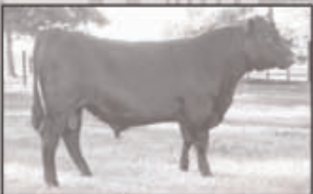
LB Ot26 97U Reg: +16657073 Sire: S S Objective T510 OT26

Thank you to everyone that attended the 2009 sale! Please consider this your personal invitation to the 2010 sale!