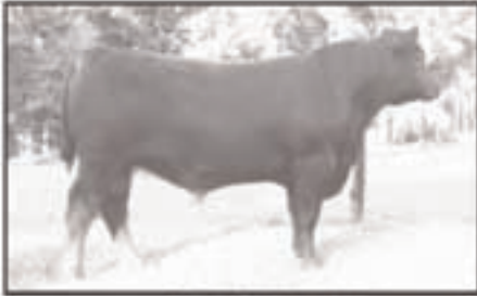
LB OT26 361 Reg: 16664307 Sire: S S Objective T510 OT26

With Special Guests Britt Angus • Elrod Farms • Partisover Ranch • Saxon Farms