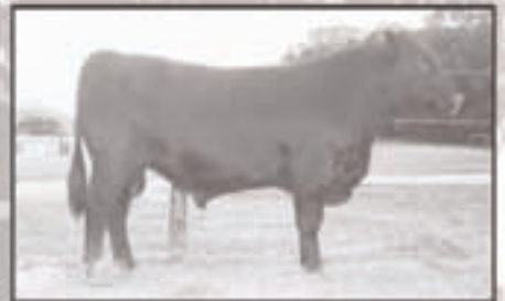
LB Ribeye Reg: 16677309 Sire: Three Trees S1381 3166 4417