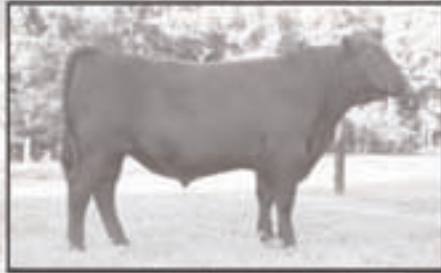
LB Answer 1015 Reg: 16677302 Sire: S A V Final Answer 0035