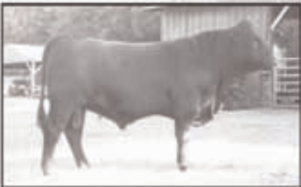
LB Hebeorth 1005 Reg: 16677307 Sire: S A V Net Worth