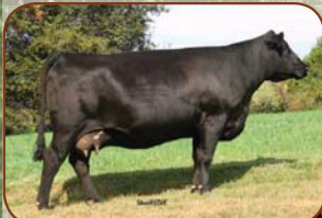
SAF Lassie 481

SAV Net Worth 4200 x Gambles Lass 604 MGS: Rito 3W3 • Reg. # 16695889