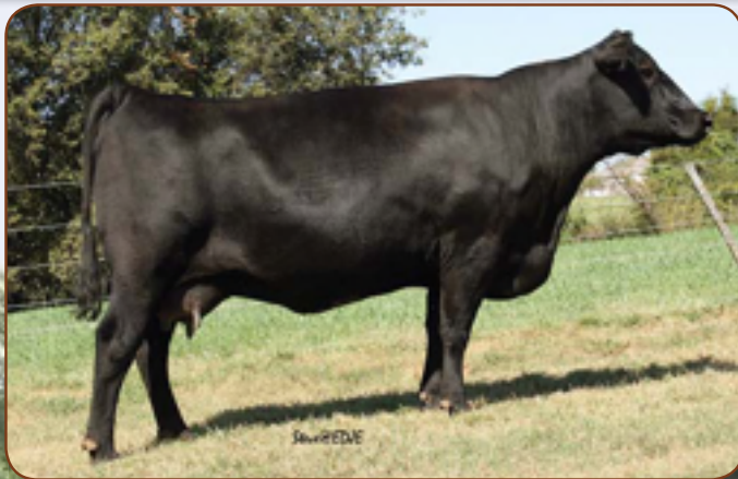
BT Rachel 553T

Saturday, October 29, 2011 • Noon • White Pine, Tennessee