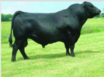
7AN303 New Day 454 Boyd New Day x B/R 323