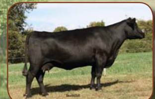
SAF Rita 403

Leachman Right Time x Richview Blackmere 8180 MGS: Sitz Traveler 8180 • Reg. #14666918