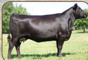
SAF Blackcap Empress 534

GAR Expectation 4915 x SAF Lassie 270 MGS: Alberta Traveler 416 • Reg. #15092556