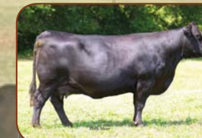
SAF Blackberry 522

Leachman Saugahatchee x F&S Miss Rita 5492 MGS: VDAR Ambush 1465 SAF • Reg. #15002556