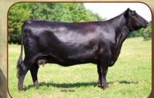
SAF Phyllis 614

SAV 8180 Traveler 004 x SAF Blackberry 423 MGS: Sitz Alliance 6595 • Reg. #15612971