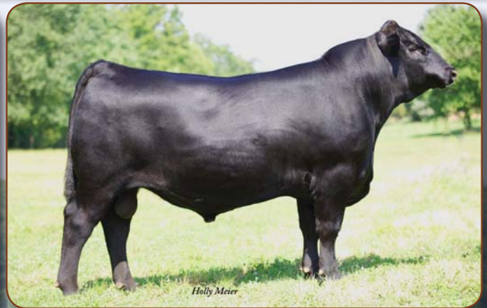
SAF Gallatin 010

BCC Bushwacker 41-93 x BT Rachel 314J MGS: BT Direction 65D • Reg. #15027663