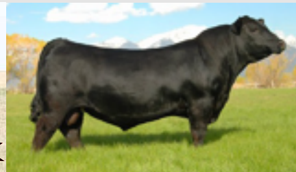
7AN330 Regis Final Answer x Onward