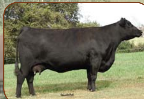
SAF Blackmere 582

SAV 8180 Traveler 004 x Kahn Blackcap Empress B152 MGS: GDAR SVF Traveler 234D • Reg. #15322193