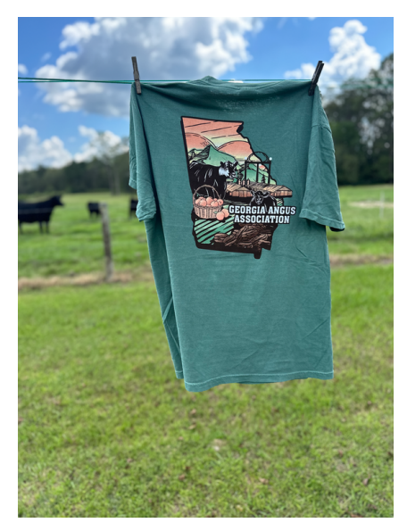
Shirts and Hats are $25