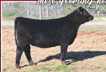
TWO RIVERS HOME TOWN T1304 21090948

G A R Home Town X B&B OP00 of 6528XPrimeDivine