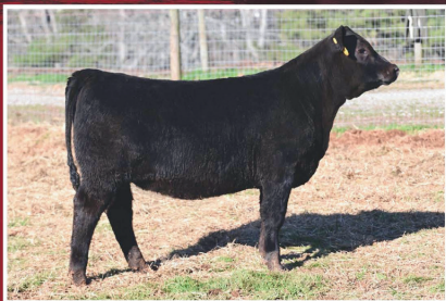
TWO RIVERS FIREBALL T1034 21003092