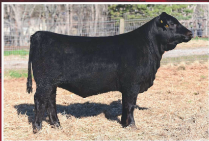
TWO RIVERS FIREPROOF T234 21019712