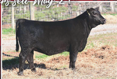
TWO RIVERS FIREBALL T1114 21020882

GB Fireball 672 X B&B OP00 of 6528XPrimeDivine